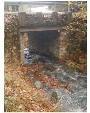
The bridge in Haidonoremma