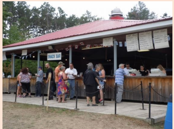
Photos from the summer's paniryri

Our brotherhood in Toronto, Canada is an example for paradigm for many Greek Clubs. As we have mentioned in previous issues, it is a vibrant association with several activities that keeps alive the memories of our village to the Karyates who have migrated to the beautiful country of Canada.