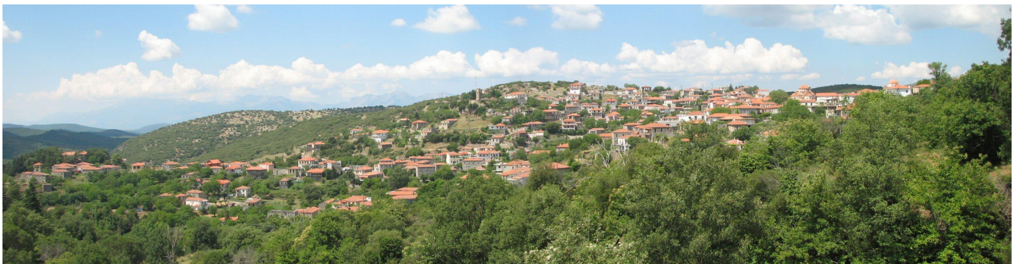
View of Karyes from the road of Agios Konstantinos

The Digital Archive of the newspaper “ΚΑΡΥΕΣ” available in http://www.karyes.gr/archives/